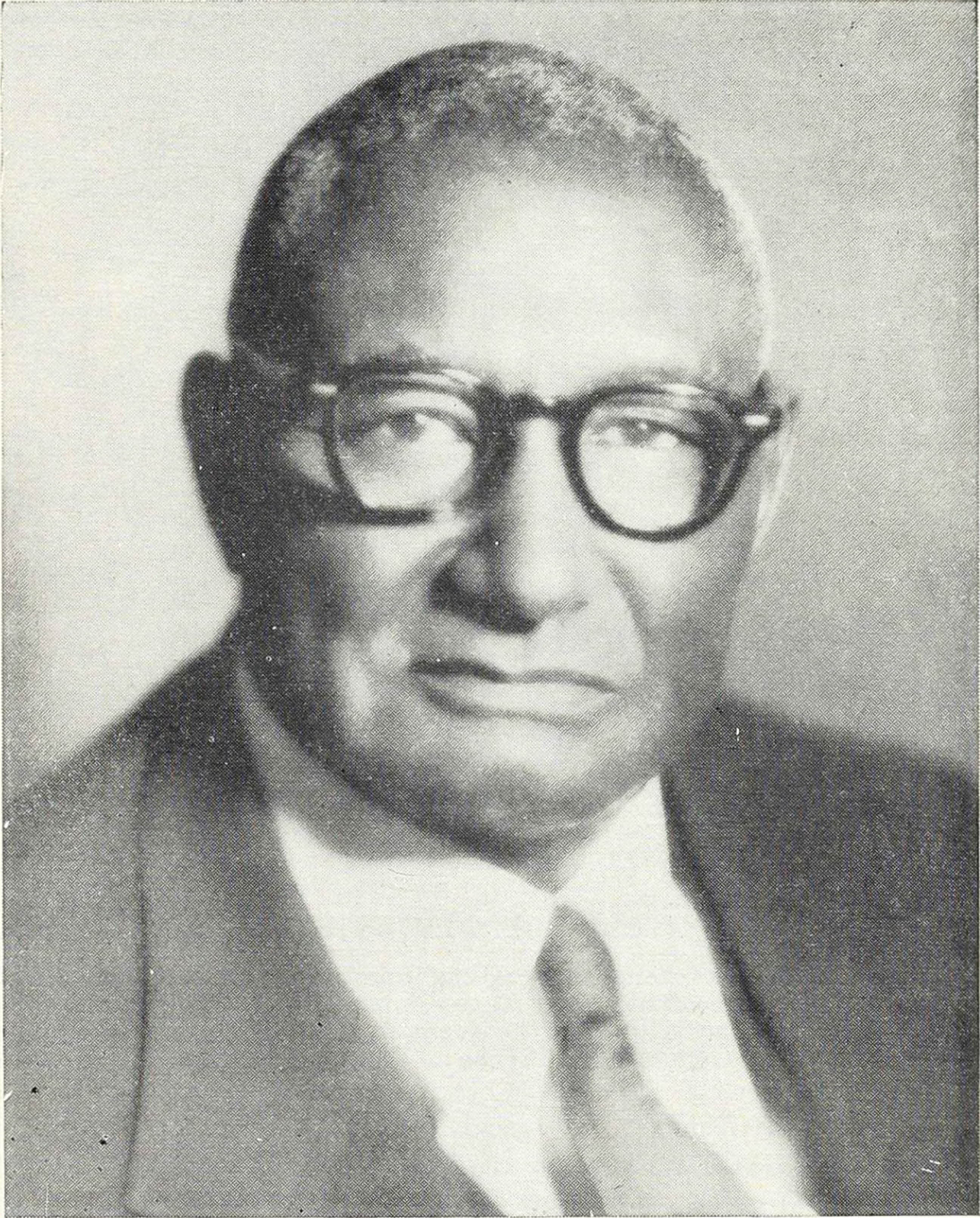
BISHOP WILLIS J. KING Resident Bishop New Orleans Area