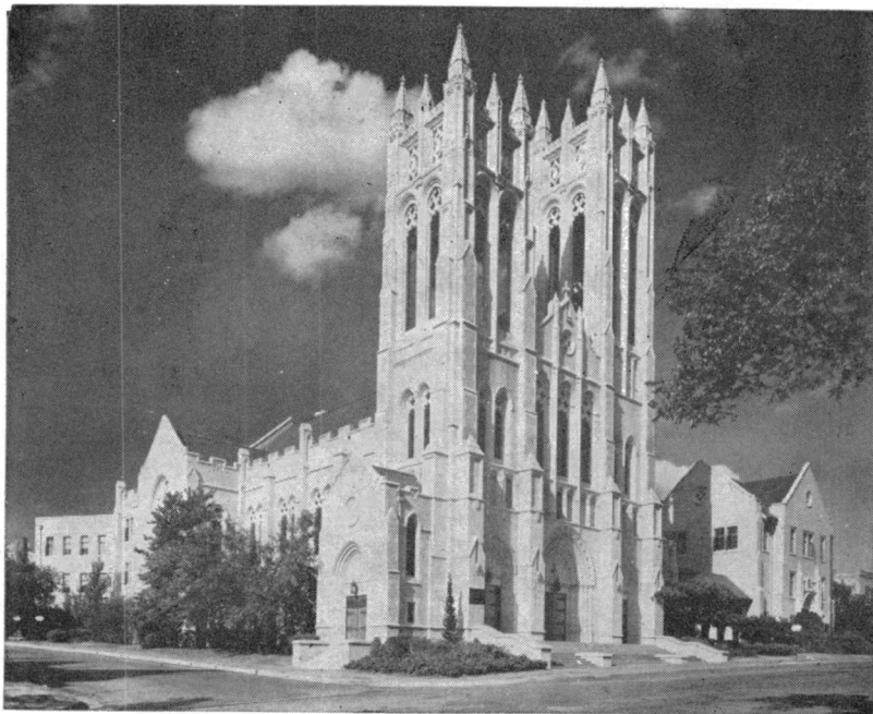
First Methodist Church, Fort Worth, Texas