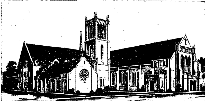
POLYTECHNIC METHODIST CHURCH