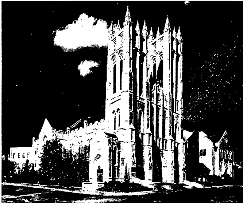
First Methodist Church, Fort Worth, Texas

Conference Organized 1866 Conference Divided 1910 Unification Merger 1939