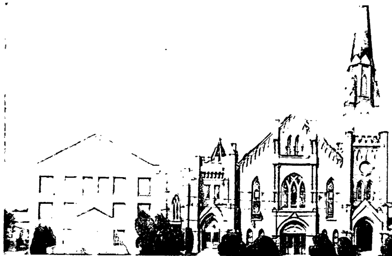
First Methodist Church, Waco, Texas