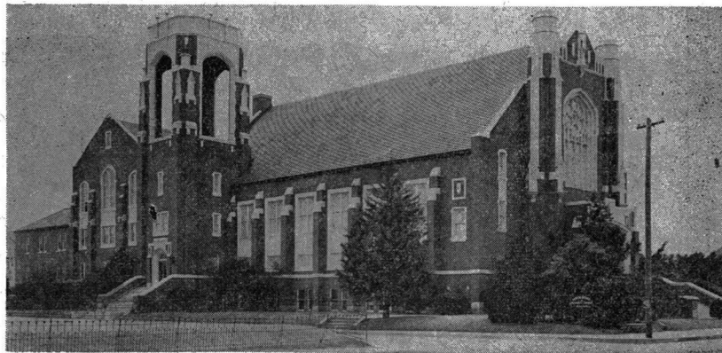
Austin Avenue Methodist Church, Waco, Texas